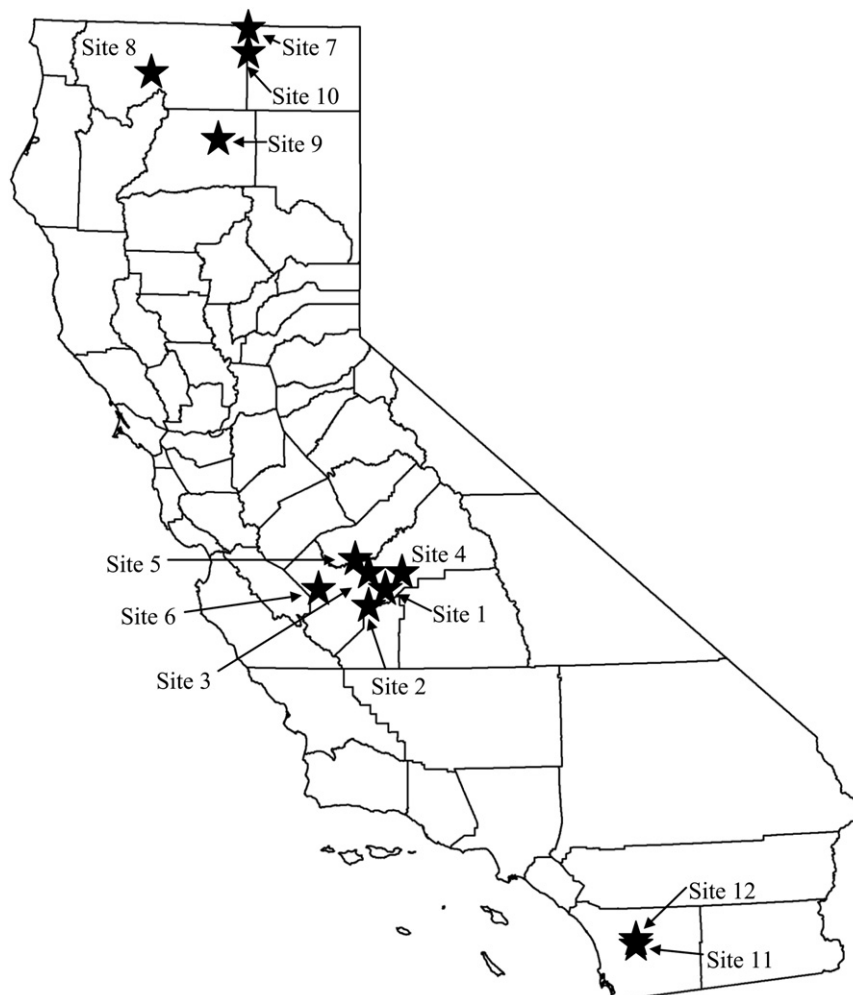
Fig. 1. The location of field sites for this study. Sites trapped during spring included 1–4, 7–8, and 11; sites trapped during autumn included 5–6, 9–10, and 12.

We selected 12 sites from throughout California for this study. These sites were located in the southern, central, and northern portions of the state (Fig. 1). Alfalfa was grown at all northern study sites while both southern sites were pastures. Grapes were grown at five of the central sites; the other central site was the Kearney