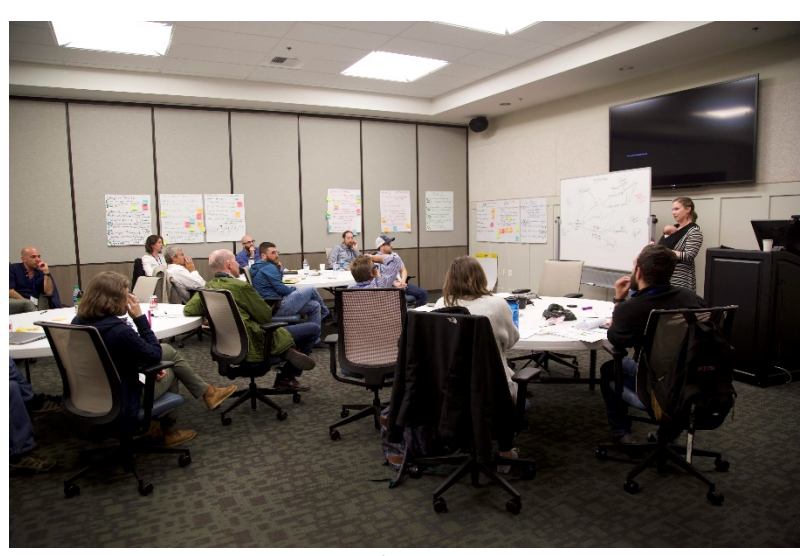
Important themes emerge from group discussion on day 2.