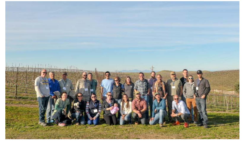
A group picture near the Matchbook vineyards during a field excursion.