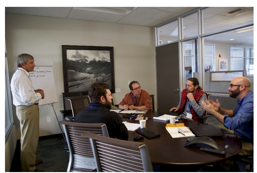
Another break-out discussion group on the topic of quantifying barn owl diet.