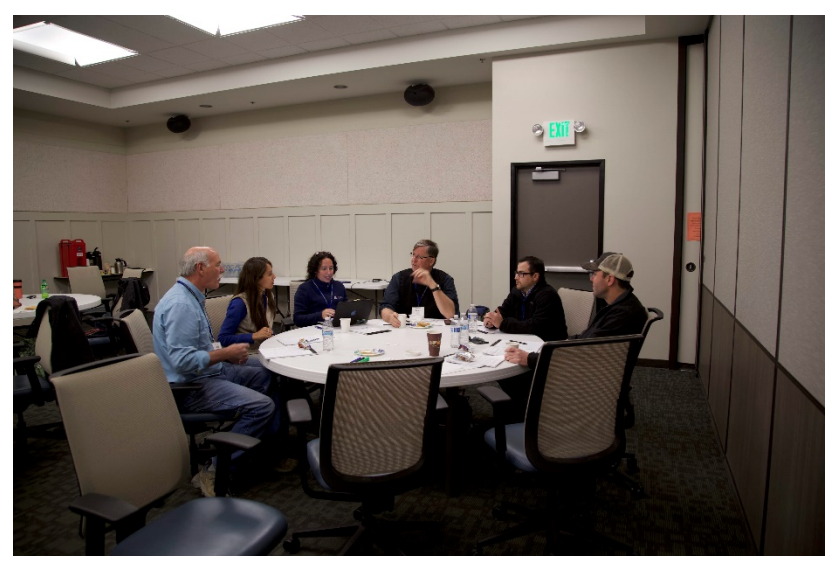
Break-out discussion group with farmers on how research agenda can address issues important for agricultural production.