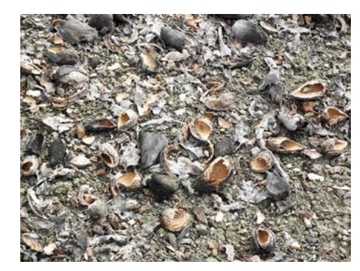
Figure 2. Example of almonds predated by rodents.

almond orchards, so long as ground cover is limited. If burrow openings are larger (2–3 inches), the roof rat is the likely culprit.