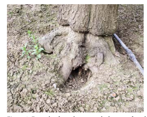
Figure 1. Example of a rat burrow at the bottom of an almond tree.

pest management program. If your management plan focuses on the wrong species, it is likely to be ineffective and it may pose hazards to nontarget species and even be an illegal misuse of the material, based on the rodenticide label information. Fortunately, the presence of roof rats and deer mice can often be detected through indirect monitoring techniques. For example, roof rats often burrow at the bottom of trees, and these burrows are typically 2 to 3 inches in diameter (figure 1). Burrows of the California ground squirrel (Otospermophilus beecheyi) are sometimes this same size, but usually they are a bit larger (average diameter = 4 inches). Also, if ground squirrels are present, you will see them running around above ground and hanging out in burrows.