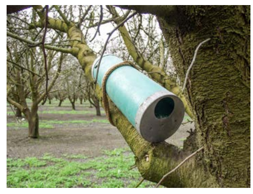
Figure 5. Bait station attached to the branch of an almond tree using a bungee cord.

These formulas will calculate the number of bait stations required for the orchard and also provide an approximate location for each bait station. Note, however, that the actual spacing between individual trees and rows of trees will dictate the ultimate placement of each bait station, which will in some cases be in the tree that is closest to the calculated location. Use bungee cords (figure 5) or wire to attach to bait stations to tree branches. Bungee cord takes less time than wire; wire is cheaper, but it is also harder to use and must be frequently replaced. Nylon cable ties were not effective for keeping bait stations securely attached to branches. To prevent spillage, bait stations should only be attached to branches that are at an angle of 45° or less from the main trunk. Bait stations can be attached to the top or the underside of the branch, but must be rotated so the hole in each end cap is at the top (12 o'clock position).