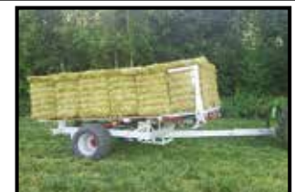
BALE CHASER JR.