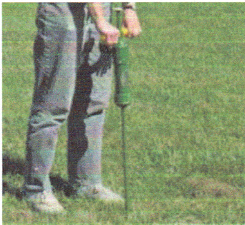
Figure 1. Probing for gopher tunnel

Step 6: Check traps 24–48 hours later. If no activity, move to new tunnel system.