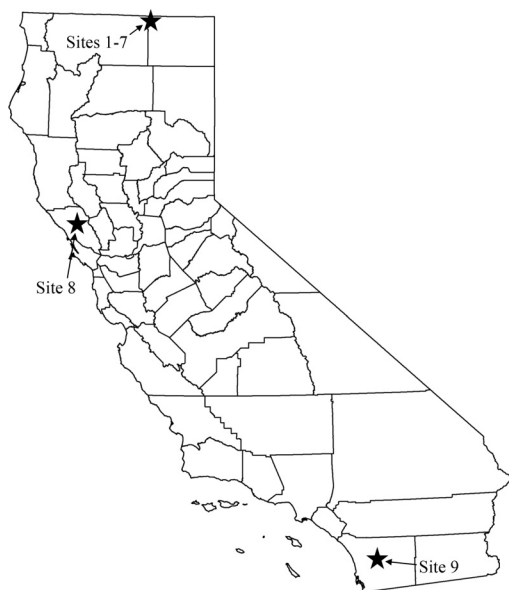
Fig. 1. Nine field sites in California where we assessed the ability to identify gender of Thomomys talpoides (sites 1–7) and Thomomys bottae (Sites 8–9) by using external reproductive characteristics.

gap and presence of external male genitalia often are used to identify gender (e.g., Pugh et al. 2003), yet this approach has not always proven effective in pocket gophers (Witmer et al. 1996), whose fusiform shape allows them to turn around in narrow tunnels. This adaptation has led to the reduction or elimination of an external scrotum in nonreproductive males and has led to the greatly reduced pelvic girdle in males and females. In fact, the ischiatic vacuity is too small to allow for birth of the young, thereby necessitating the reabsorption of the pubic symphysis in females before mating occurs (Hisaw 1924, 1925). As such, an assessment of the ventral side of the pubic symphysis has been suggested to be fairly effective at discerning gender in pocket gophers, but it is obviously less effective on immature females for which the pubic symphysis has not been reabsorbed (Baker et al. 2003). Connior and Risch (2009) suggested that a combination of external characteristics, including genitalia and mammae, were effective at identifying gender of Ozark pocket gophers ( Geomys bursarius ozarkensis ). We thought this approach was worth pursuing further, given the reported utility combined with the relatively minimal training that would