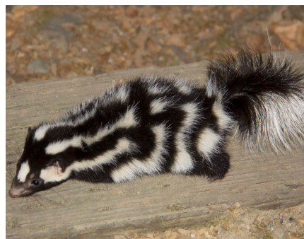
Figure 1. Western spotted skunk, Spilogale gracilis .

Skunks are attracted to residential areas by the availability of food, water, and shelter. They become a nuisance when they live under porches, decks, garden tool sheds, or homes. Their scent is usually not welcome around homes, and they often spray dogs that bark and approach rapidly. They like to feed on ripening berries and fallen fruit and cause other garden problems by digging while in search of grubs and other insects. They often search for food in lawns by digging small pits