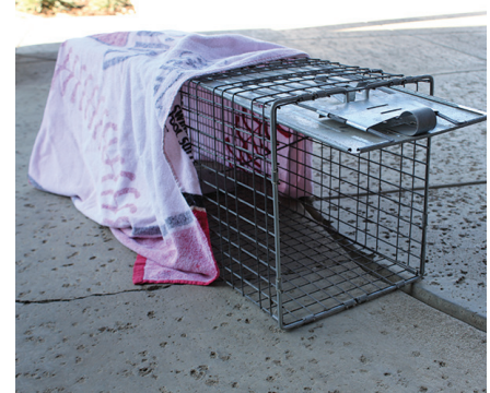
Figure 4. Cage trap with blanket covering the back end.

drawn from beneath the building by a furnace or climate control system.