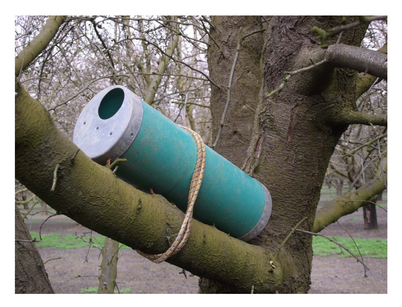
Figure 2. Bait station used for roof rat and deer mouse control in almond orchards in western Fresno County, CA.