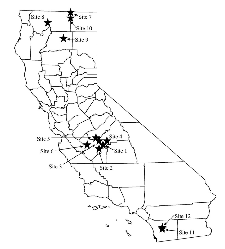
Fig. 1. The location of field sites for this study. Sites trapped during spring included 1–4, 7–8, and 11; sites trapped during autumn included 5–6, 9–10, and 12.

We selected 12 sites from throughout California for this study. These sites were located in the southern, central, and northern portions of the state (Fig. 1). Alfalfa was grown at all northern study sites while both southern sites were pastures. Grapes were grown at five of the central sites; the other central site was the Kearney